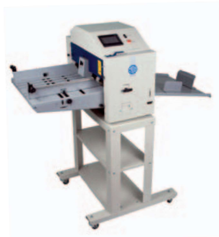
mobile table for easy manipulation as a standard equipment