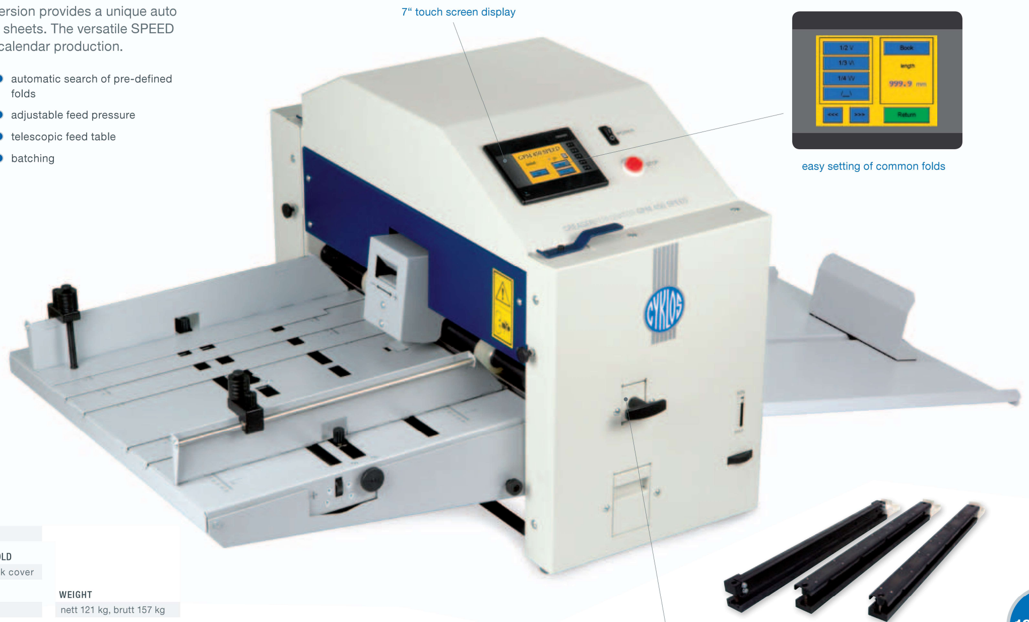
7" touch screen display