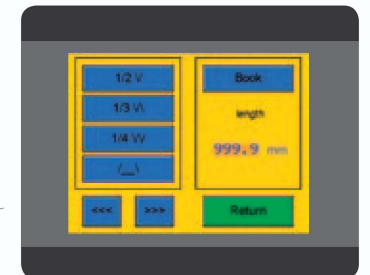
easy setting of common folds