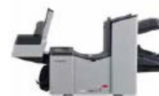
DS-75 Configuration 4