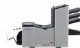
DS-75 Configuration 1