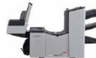
DS-75 Configuration 3