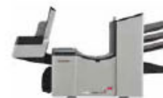
DS-75 Configuration 2