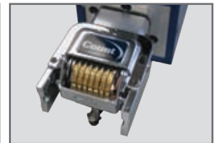
Numbering Head Wheel With Font Style Gothic (7)

The COUNT™ NumberPro is a basic hardworking solution for numbering, scoring and perforating on a wide range of paper stocks. Simple touchscreen programming allows you to number, perf (including micro-perf) or score individually or simultaneously. Number virtually anywhere up to 12 times per sheet, and add a second head for an additional 12 times – or crash number carbonless forms (up to 6 parts). Includes the patented self-inking cartridges to eliminate re-inking.