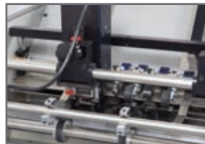
Comes with One or Two Touchscreen Control Numbering Heads

A numbering, perforating and scoring machine that's fast, easy to use and reliable.