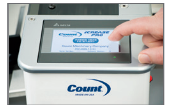
Touch Screen Controller

The COUNT™ iCrease Pro is a simple yet robust solution for creasing of digital media to eliminate cracking when folding. The iCrease Pro gives you all of the automation of bigger COUNT machines in a simple hand-feed machine anyone can use.