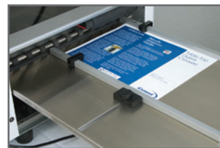
One Step Feed