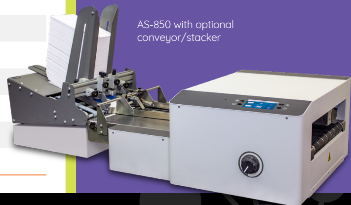
AS-850 with optional conveyor/stacker

Quadient maintains a network of offices across the country to provide local customer support and trained technicians who are ready to assist you. You can be confident that when you need knowledgeable support or expert service, the point-of-contact will be a Quadient office in your area consisting of a team of local professionals.